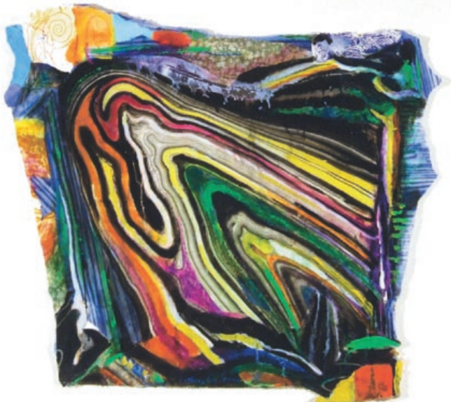
"Worlds Seen & Imagined: Untitled" 2000-03 by Terence La Noue, mixed media on paper, 25" x 27". From the collection of Davis Graham & Stubbs.