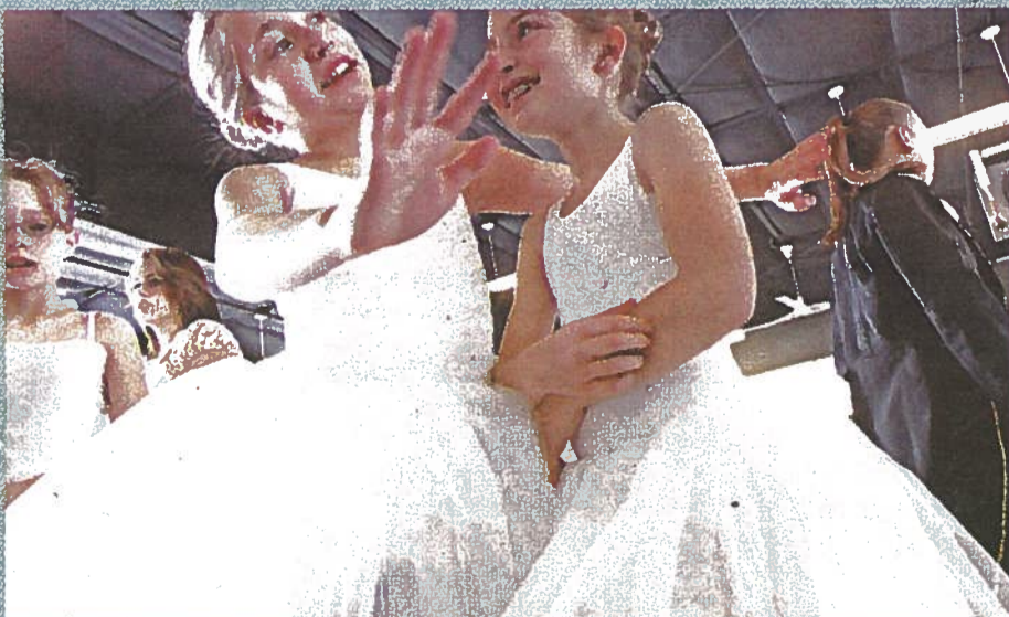
GAC dancers were full of enthusiasm at a rehearsal last weekend.