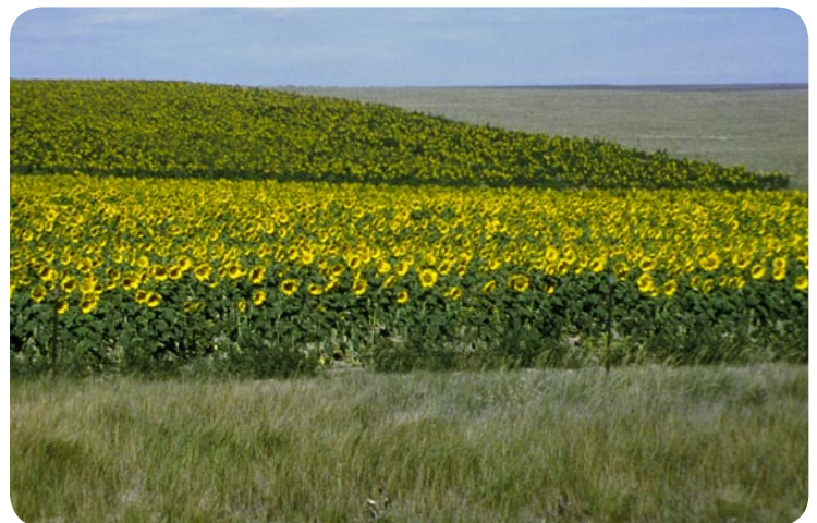
Field of sunflowers near Cheyenne Wells.

Commonly, the folk arts are described as part of a culture's artistic repertoire, passed on informally from generation to generation, gathering ideas and technology from each era. The folk arts are not typically found in galleries. Rather, they are on the backs of horses—handmade saddles with intricate patterns embossed to the liking of the maker and the rider. (See the section on saddle making in the exhibit catalog, Master/Apprentice: Colorado Folk Arts and Artists, 1986-1990 pp.46.53.) They are found